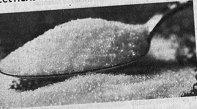
SUGAR PRODUCTION (million tonnes)