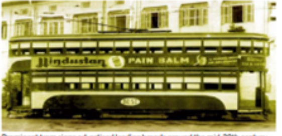
Prominent tram signs advertised leading brands around the mid-20th century.