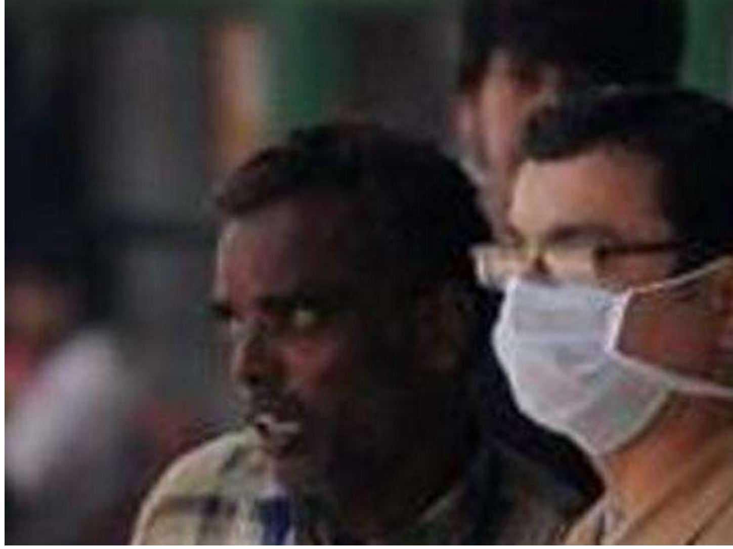
Globally, such exposure contributed to about 2.76 lakh deaths and 15.2 million life years lost to disability in 2017.